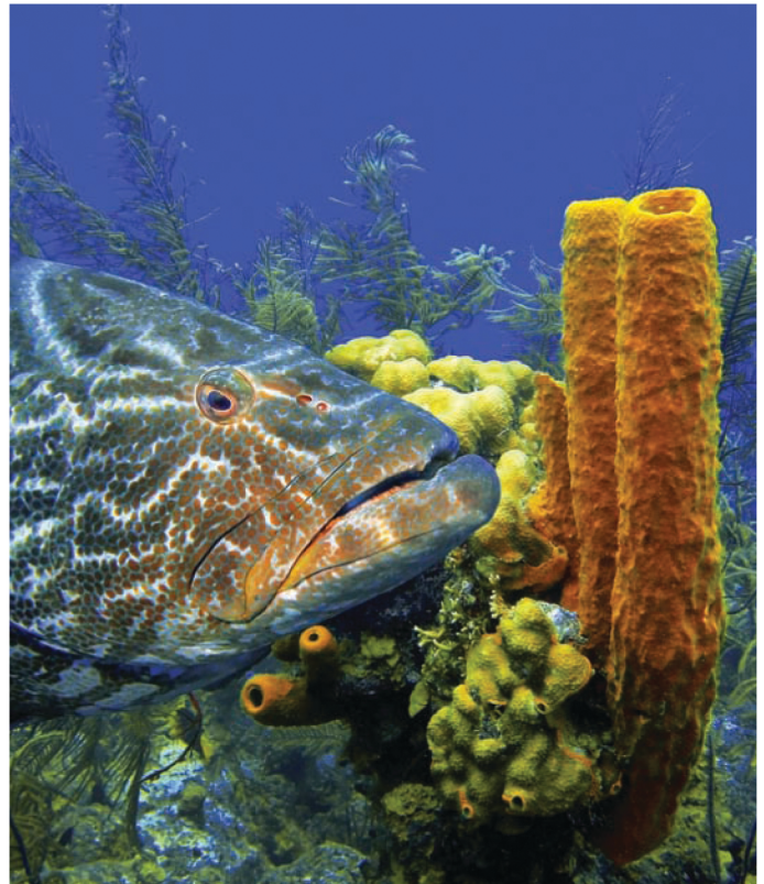
Marine protected areas conserve and restock fisheries, critical resources for coastal communities.

Implications: Protected area specialists need to work more closely with relevant national and local level governments and technical agencies responsible for managing ecosystem services such as water supplies, coastal protection, flood control etc. In some cases, investments in restoring ecosystems within, and adjacent to, protected areas may be more cost-effective than investing in hard infrastructure alone.