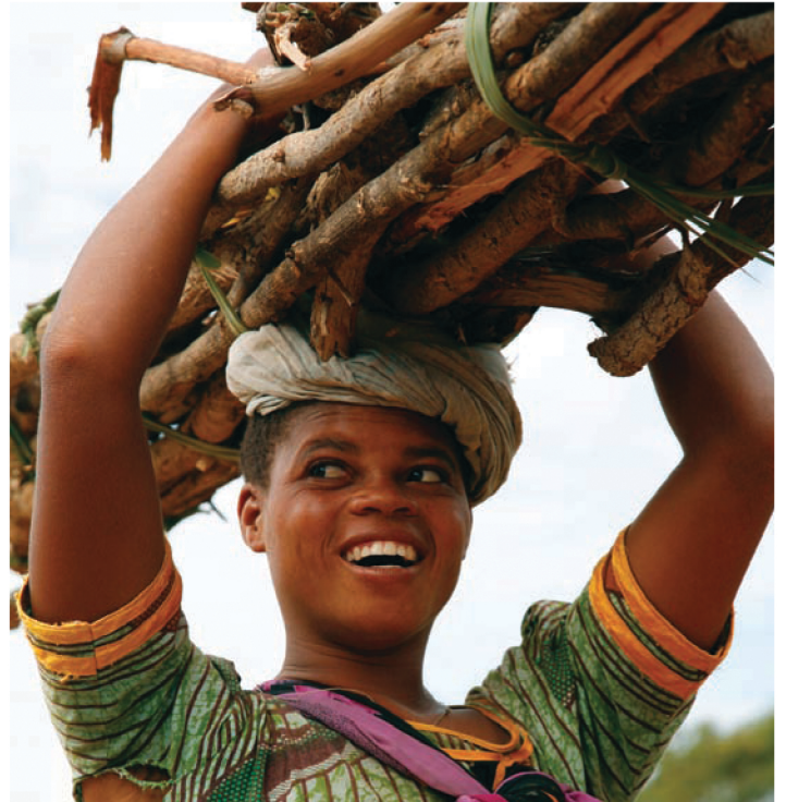
Protected areas help to reduce the impacts of climate change on vulnerable communities.

Protected areas are efficient and cost effective tools for ecosystem management, with associated laws and policies, management and governance institutions. Increased coverage and connectivity at the landscape level and more effective management will enhance the resilience of ecosystems to